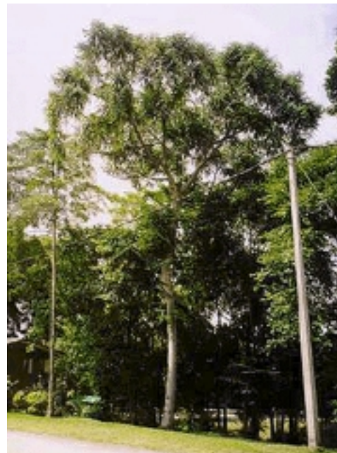
Tree habit.